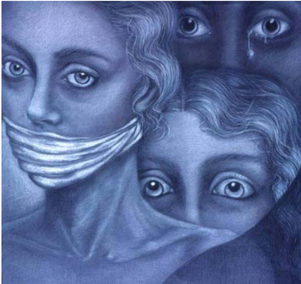
Photo Essay- Democracy and Freedom of Expression (1)