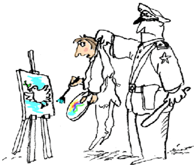
Photo Essay- Democracy and Freedom of Expression (3)