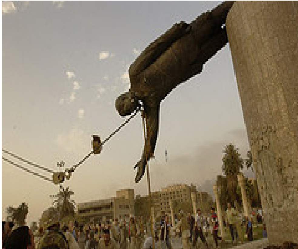
Photo Essay- Exporting Democracy to Iraq – 2003-06 (1)