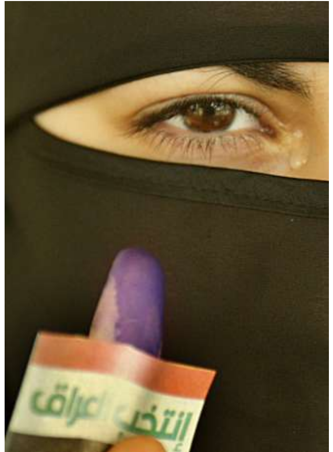
Exporting Democracy to Iraq – 2003-06 (5)

The next issue of the Lokniti newsletter will be published in December 2006.