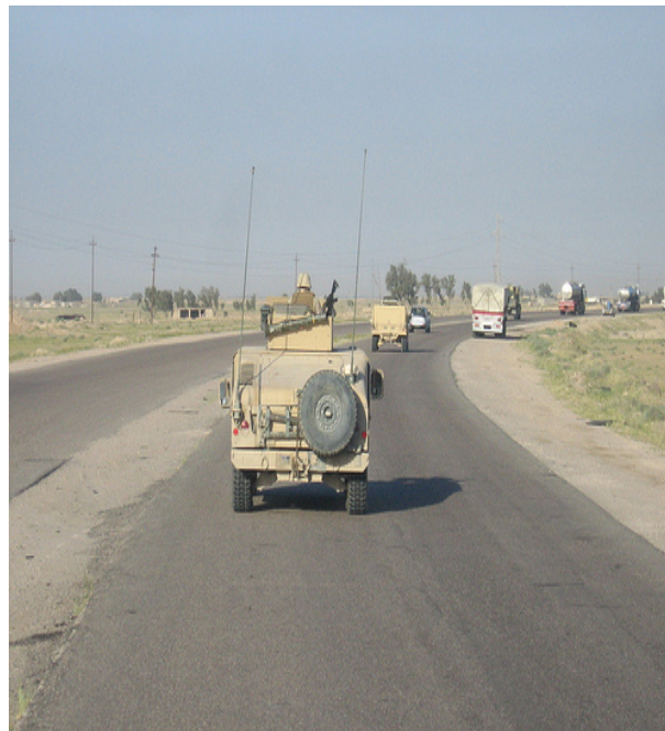
Exporting Democracy to Iraq – 2003-06 (2)